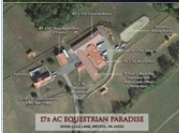
17± AC EQUESTRIAN PARADISE