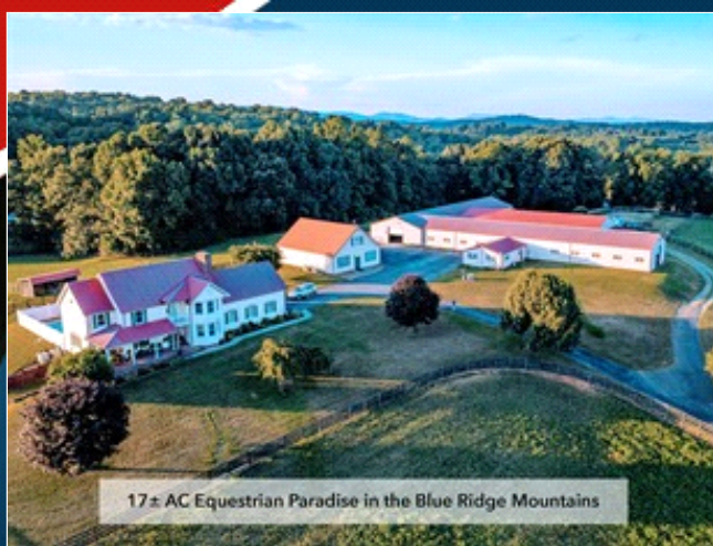
17± AC Equestrian Paradise in the Blue Ridge Mountains