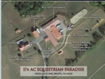
17± AC EQUESTRIAN PARADISE

Bedrooms: 4 Year Built: 1992 Lot Size: 17 acres Sqft: 2614