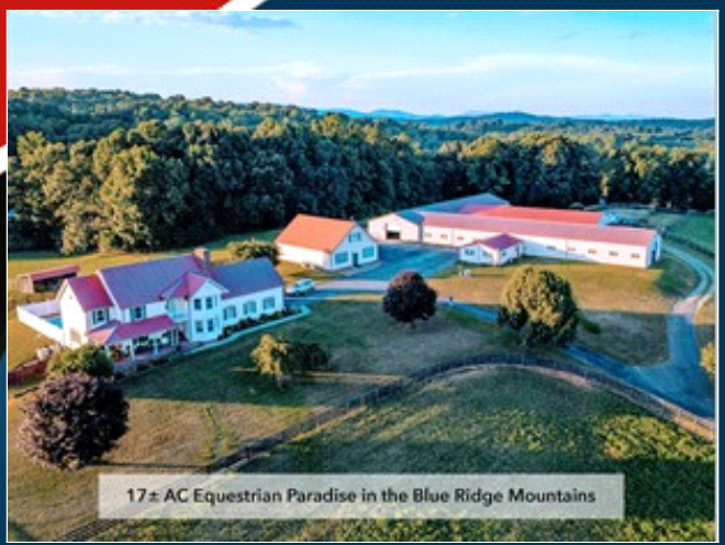
17± AC Equestrian Paradise in the Blue Ridge Mountains